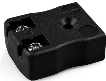
Miniature in-line Socket - Quick Wire (dimensions in mm)

Labfacility are the UK's leading manufacturer of Temperature Sensors, Thermocouple Connectors and associated Temperature Instrumentation and stockings of Thermocouple Cables. The Company has been trading since 1971 and is ISO9001 accredited.