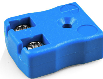
Miniature in-line Socket - Quick Wire (dimensions in mm)

Labfacility are the UK's leading manufacturer of Temperature Sensors, Thermocouple Connectors and associated Temperature Instrumentation and stockings of Thermocouple Cables. The Company has been trading since 1971 and is ISO9001 accredited.