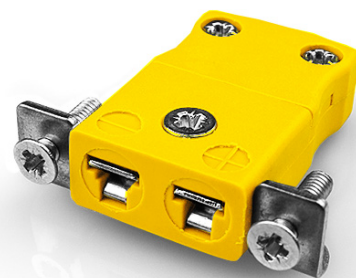
Miniature in-line Socket with stainless steel mounting bracket (dimensions in mm)

Labfacility are the UK's leading manufacturer of Temperature Sensors, Thermocouple Connectors and associated Temperature Instrumentation and stockings of Thermocouple Cables. The Company has been trading since 1971 and is ISO9001 accredited.