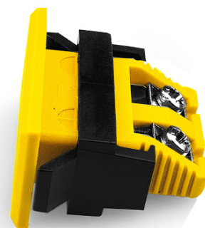
Miniature Fascia Socket (with nylon mounting clip) (dimensions in mm)

Labfacility are the UK's leading manufacturer of Temperature Sensors, Thermocouple Connectors and associated Temperature Instrumentation and stockings of Thermocouple Cables. The Company has been trading since 1971 and is ISO9001 accredited.