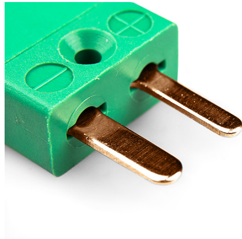
Miniature in-line Plug (dimensions in mm)

Labfacility are the UK's leading manufacturer of Temperature Sensors, Thermocouple Connectors and associated Temperature Instrumentation and stockings of Thermocouple Cables. The Company has been trading since 1971 and is ISO9001 accredited.