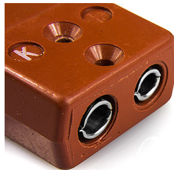
Standard Hi-Temp Plastic in-line Socket - HTP (dimensions in mm)

Labfacility are the UK's leading manufacturer of Temperature Sensors, Thermocouple Connectors and associated Temperature Instrumentation and stockings of Thermocouple Cables. The Company has been trading since 1971 and is ISO9001 accredited.