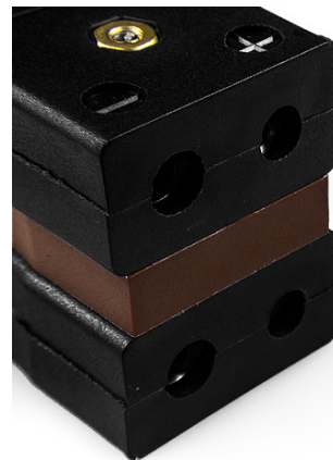
Standard Duplex in-line Socket (dimensions in mm)

Labfacility are the UK's leading manufacturer of Temperature Sensors, Thermocouple Connectors and associated Temperature Instrumentation and stockings of Thermocouple Cables. The Company has been trading since 1971 and is ISO9001 accredited.