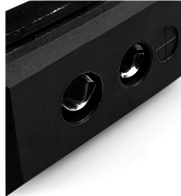
Standard Fascia Socket (with nylon mounting clip)