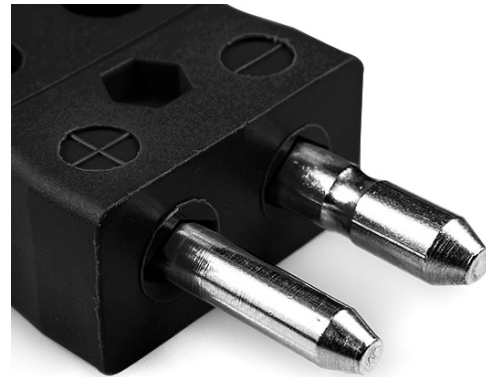
Standard in-line Plug - Quick Wire (dimensions in mm)

Labfacility are the UK's leading manufacturer of Temperature Sensors, Thermocouple Connectors and associated Temperature Instrumentation and stockings of Thermocouple Cables. The Company has been trading since 1971 and is ISO9001 accredited.