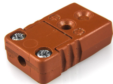
Miniature Hi-Temp Plastic in-line Socket - HTP (dimensions in mm)

Labfacility are the UK's leading manufacturer of Temperature Sensors, Thermocouple Connectors and associated Temperature Instrumentation and stockings of Thermocouple Cables. The Company has been trading since 1971 and is ISO9001 accredited.