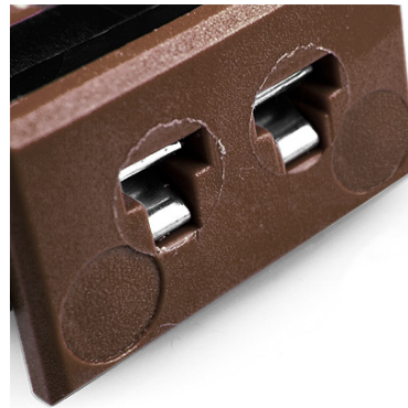
Miniature Fascia Socket (with nylon mounting clip) (dimensions in mm)

Labfacility are the UK's leading manufacturer of Temperature Sensors, Thermocouple Connectors and associated Temperature Instrumentation and stockings of Thermocouple Cables. The Company has been trading since 1971 and is ISO9001 accredited.