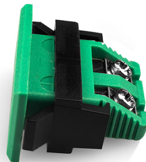
Miniature Fascia Socket (with nylon mounting clip) (dimensions in mm)

Labfacility are the UK's leading manufacturer of Temperature Sensors, Thermocouple Connectors and associated Temperature Instrumentation and stockings of Thermocouple Cables. The Company has been trading since 1971 and is ISO9001 accredited.