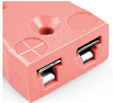
Miniature in-line Socket - Quick Wire (dimensions in mm)

Labfacility are the UK's leading manufacturer of Temperature Sensors, Thermocouple Connectors and associated Temperature Instrumentation and stockings of Thermocouple Cables. The Company has been trading since 1971 and is ISO9001 accredited.