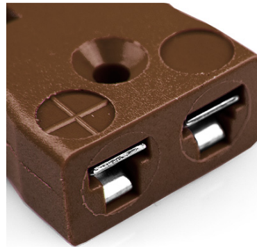
Miniature in-line Socket - Quick Wire (dimensions in mm)

Labfacility are the UK's leading manufacturer of Temperature Sensors, Thermocouple Connectors and associated Temperature Instrumentation and stockings of Thermocouple Cables. The Company has been trading since 1971 and is ISO9001 accredited.