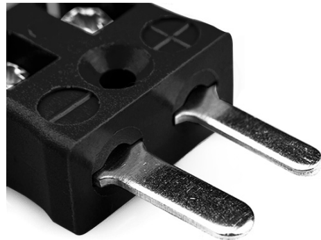
Miniature in-line Plug - Quick Wire (dimensions in mm)

Labfacility are the UK's leading manufacturer of Temperature Sensors, Thermocouple Connectors and associated Temperature Instrumentation and stockings of Thermocouple Cables. The Company has been trading since 1971 and is ISO9001 accredited.