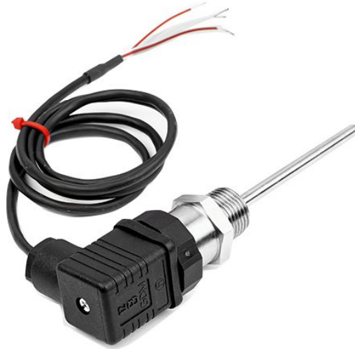
'HIRSCHMANN PT100 PROBE ASSEMBLY'