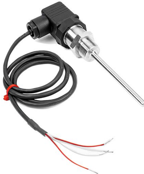
'HIRSCHMANN PT100 PROBE ASSEMBLY'