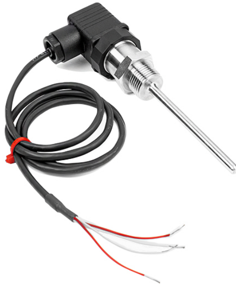
'HIRSCHMANN PT100 PROBE ASSEMBLY'