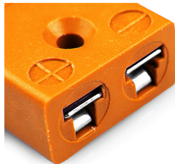
Miniature in-line Socket (dimensions in mm)

Labfacility are the UK's leading manufacturer of Temperature Sensors, Thermocouple Connectors and associated Temperature Instrumentation and stockings of Thermocouple Cables. The Company has been trading since 1971 and is ISO9001 accredited.