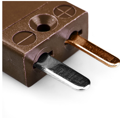
Miniature in-line Plug (dimensions in mm)

Labfacility are the UK's leading manufacturer of Temperature Sensors, Thermocouple Connectors and associated Temperature Instrumentation and stockings of Thermocouple Cables. The Company has been trading since 1971 and is ISO9001 accredited.