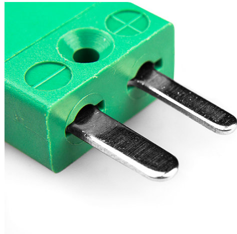
Miniature in-line Plug (dimensions in mm)

Labfacility are the UK's leading manufacturer of Temperature Sensors, Thermocouple Connectors and associated Temperature Instrumentation and stockings of Thermocouple Cables. The Company has been trading since 1971 and is ISO9001 accredited.